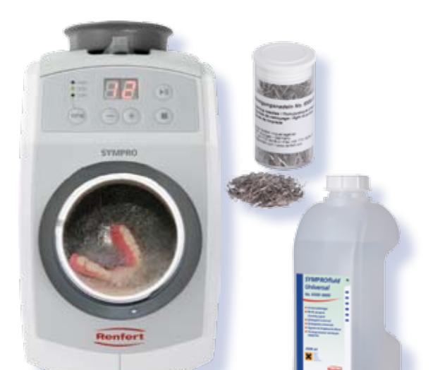
The Renfert SYMPRO in action.