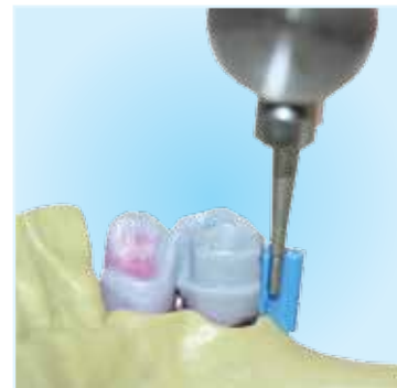
The male attachment should be adapted to the ridge and then luted to the waxed crown.