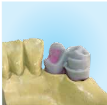
Crowns are waxed and milled to accommodate the path of insertion.