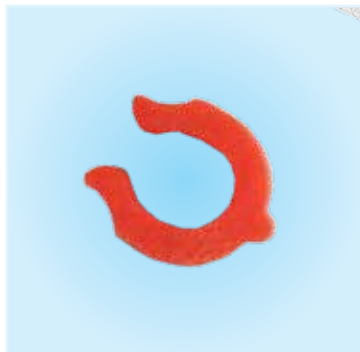
Retention sleeves have a spine for anti-rotation and a flexible outer opening for easy insertion.