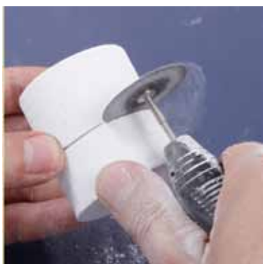
Dynex separating discs are double cross linked with high-tech fibreglass reinforcement.

RPM rotational speed. The other two discs are more suited to non-precious and chrome cobalt. These three separating discs cut so quickly, that far less heat is generated on the surface than usually the case. In addition the discs are made with a special organic binder which considerably reduces the unpleasant odor. For more information on Dynex discs and samples call 1-800-250-5111.