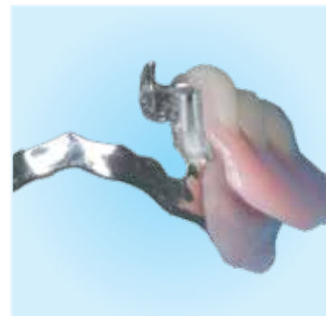
The finished RPD is ready for initial insertion after sterilization first using the lightest retention sleeve.