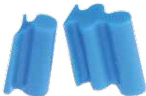
Another type of male available has no mandrel; the one on the left needs a milled ledge. The other has the shear distributor already integrated into the male.

patterns. Males must be vertically parallel and should be positioned over the crest of the gingival ridge. The adjoining area of the attachment is concave, thus allowing the male to be placed in close proximity to the wax pattern, thus reducing the amount of leverage exerted on the attachment. A milled in lingual rest will act as a stress breaker. The male pattern has no sharp edges and can be adapted to the ridge, respectively it can be shortened up to 40% in cases with limited inter occlusal space. The interlock is drilled with a 1 mm wax miller and its position is predetermined at 170 degrees off center of the male attachment. Proceed with a 1.5 mm wax miller and starting from left to right at a speed of 5000 to 7000 RPM, cut the lingual facing approximately 1.5 mm deep. The male attachment is then placed on the distal of the waxed crowns. It is essential that the male attachment is parallel vertically, sagittally and centered on the ridge. Or else binding will occur and early attachment wear will be the result. Sprue and cast the restoration and prepare a milling model so subsequent milling of the stress distributor can take place. A profile milling bur is utilized to refine the milled ledge at 15,000 to 20,000 RPM rotational speed. Next a 1.0 mm groove bur re-mills the interlock. The male attachment is also gently milled with a 1.5 mm round end profile bur to remove any bubbles or imperfections and also