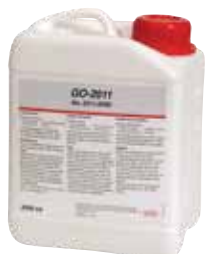
GO-2011 is a very effective all in one cleaner for alginate and gypsum residue.

gypsum based investment material and alginates even in hard to reach areas. GO-2011 is ready to use, quick acting and most effective when used in an ultrasonic cleaner at 40 to 50 degrees Celsius. The best cleaning time is 5-15 minutes in ultrasonic and 15-90 minutes without it. GO-2011 has been relabeled, has a pleasant subtle lemony scent and it does not etch acrylics, metals or glass. Contact us today for more details at 1-800-250-5111.