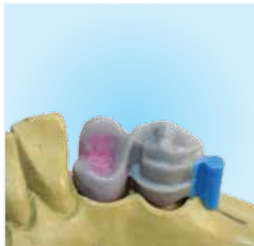
To avoid binding on insertion, the male should be parallel vertically, sagittally and centred on the ridge.