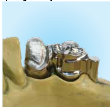
The crowns are cast and the lingual areas and male attachment are refined with milling burs.