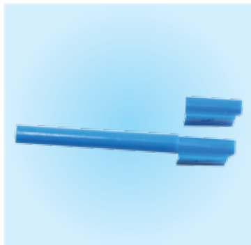
The male attachment comes with or without a parallel mandrel for convenience.