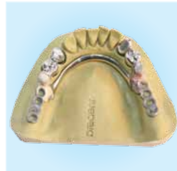
The RPD should fit the model and crowns without binding before processing the acrylic resin.