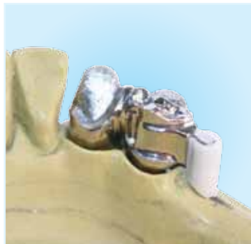
The white duplicating matrix is adapted and a duplication is made for the removable partial.