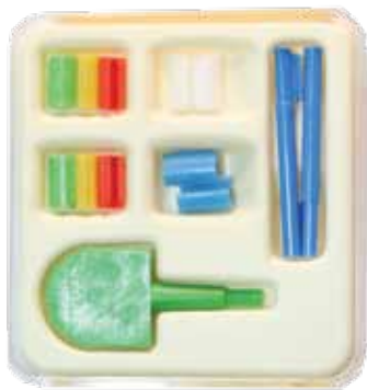
The Vario Soft 3 assortment contains males on mandrels, females, duplicating matrices and wax parts.