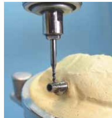
Drilling the hole before cutting the thread.