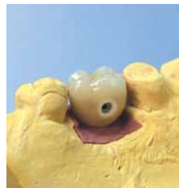
Veneered coping with the bredent screw.