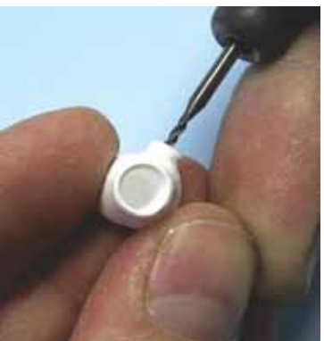
Use a 30% larger primary drill to allow for shrinkage.