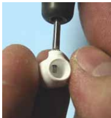
The countersink should also be 30% larger.