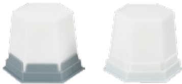
Renfert's Geo Snow White Diagnostic Waxes

Renfert's transparent diagnostic wax is best suited for pressable ceramics.