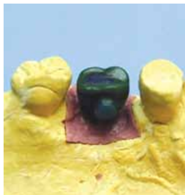
Wax up with a thickening (4.0 mm wax sprue) for the screw head.