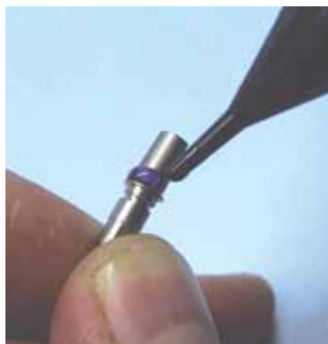
Wax up the secondary part with Pi-Ku-Plast modelling resin.