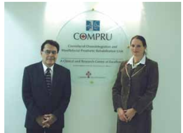
COMPRU is a world leading rehabilitation facility helping patients regain self-esteem and productive lives.

enjoyed our visit and came away with a genuine respect for this aspect of our profession.