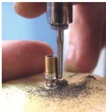
A 2° milling bur is used to create a conical shape of the abutment.