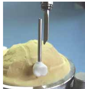
Measuring out the direction of insertion.

model since this ensures free access to the desired drilling point. Place the sintered crown on the abutment and tilt the milling table until the drill hole is in the vertical position. Place the positioning tool into the drill hole and align vertically using the Brenometer locating pin and then fix the position of the milling table. The locating pin in the milling machine is replaced by the positioning tool and is inserted into the conical counter bore of the ZrO 2 crown once more. If the axial direction is correct, the position is fixed mechanically on the milling table and the zirconium crown is removed. The tungsten carbide center drill 1.4 mm is clamped in to the milling machine chuck and a small depression is drilled into the abutment while adding milling and drilling oil. In order for the technique to work the wall thickness should be at least 1.2 mm. The Diatit- Multidril 1.2 x 5 mm is placed in the chuck of the milling machine hand piece and used to drill a hole through the first wall of the abutment. Place the zirconium crown back onto the abutment and then drill into the abutment with the tungsten carbide facing cutter up to a depth of .03 mm. The proper depth is reached when the facing cutter reaches the internal conical wall of the