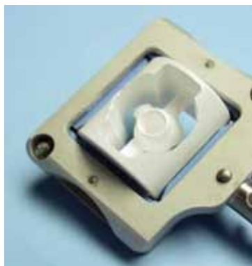
Milled crown made from "Cercon". (Degudent).