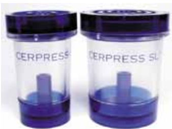
Cerpress-SL; available in either a 100 gram or 200 gram size.

The Cerpress SL Pressing Ring is a patented paperless ring system for use with all pressible ceramics. These 100 and 200 gram rings are made from the same clear plastic material as our traditional ringless system for casting alloys. The height and volume dimensions have been specifically