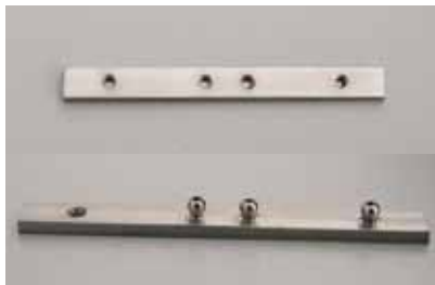
This titanium preformed bar can accept up to four exchangeable titanium studs.