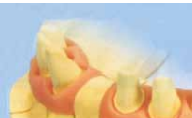
Bredent's Multisil Mask Soft.

When using the gingival mask on the model, over contouring of the crown surfaces can be avoided. Therefore crowns can be shaped naturally so that the gingival emergence is ensured. Ideal for the fabrication of implants, Multisil-Mask is quick and easy to use, because of the cartridge dosing system. The great dimensional stability and high tensile strength allows it to be removed and repositioned as often as desired. The light pink colour of Multisil-Mask matches