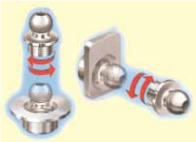
Bredent's exchangeable studs are available in both 2.2 mm & 1.7 mm

to accept four exchangeable studs. The bar is 50 mm long, 5 mm high and 2 mm thick and can be sectioned to fit between manufactured titanium implant abutments supplied by the major implant companies. The preferred method is to laser weld the sections into position before threading in the exchangeable stud. Then the case can be finished with a super structure in the metal of your choice which will house the retention inserts within the finished over denture. In this way, time to completion, restorative expenses and the longevity of the restoration can be predicted and related to the patient. Source; Peter T. Pontsa RDT can be reached at info@dent-line.com