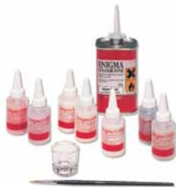
The Enigma Colour Tone now consists of eight colours.