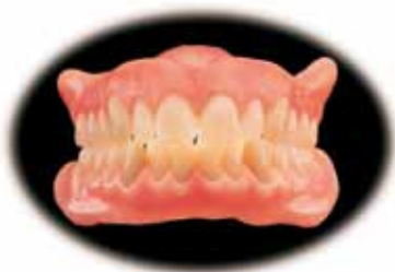
Used together, the components of the Enigma System present you with a range of aesthetic possibilities which is almost endless and will provide your patients with the "prosthetic privacy" they deserve. Peter T. Pontsa, RDT

them. Familiarize yourself with the various colours. A custom shade chart can be created by pouring out a little of each colour and adding monomer to it on white backed paper. This will give an indication of the true colour as you can choose pigments for Asian, African, Caribbean or for Caucasian patients. Layer thickness is 1 to 2 mm and it should be sufficient to block out an implant substructure or a removable partial framework. The Enigma Colour Tone powders have been designed to have very good flow properties so that they can be applied in thin layers. It is not desirable to squeeze out the powders since the flow properties are fine grained and are more suited to be tapped out of the bottle which allows uniform blending of the colours. Sift on in layers in a room temperature flask and avoid sharp demarcations. Dispense a little Enigma Colour Tone liquid into the dappen dish provided and use a brush to apply small quantities of monomer just above the powder so that it seeps down the walls of the flask and is absorbed by the powder. Continue until no areas of dry powder remain. It is important to cover all areas since a veined acrylic would show through and alter the "Colour Tone Effect". The colour tone powders can be applied to the palatal aspect; specifically the rugae. A base shade should be chosen with care since it will be able to change the colour tone shades. Colours and suggested applications;